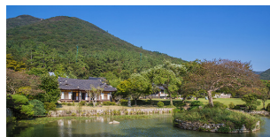
Ullim Sangang House [State-designated scenery No.80]