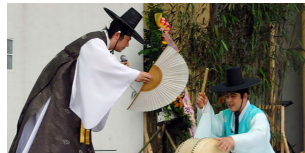
Regular performance of Saturday folklore traveling