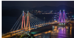
Jindo bridge · tower