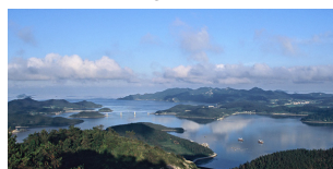
Jodo Island, Gwanmaedo Island