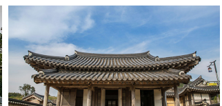
Jindo Namdo Jinseong [State designated historical site No. 127]