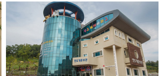
Jindo dog theme park