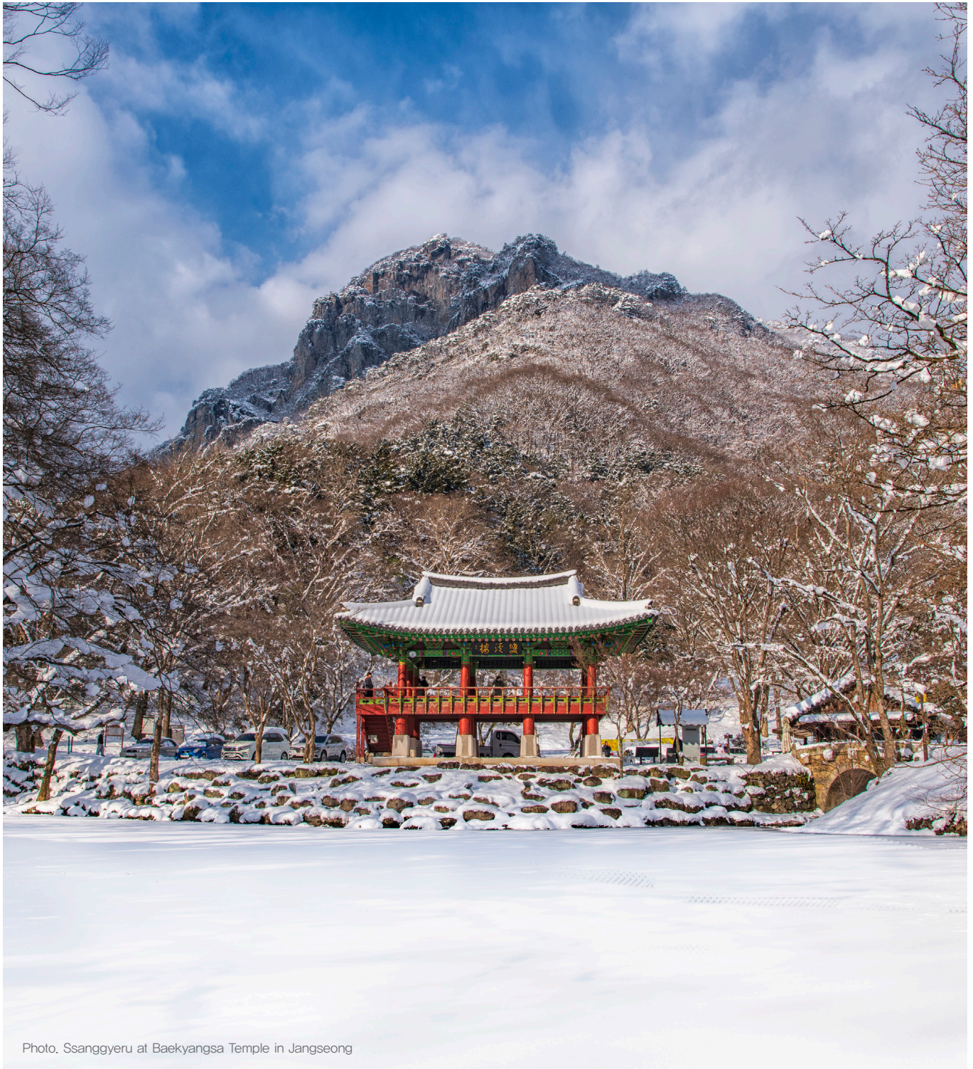
Photo. Ssanggyeru at Baekyangsa Temple in Jangseong