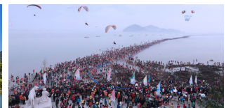
Mysterious sea route [State-designated scenery No.9]