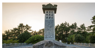
Admiral Yi Sun-sin Byeokpajin Mattle Monument